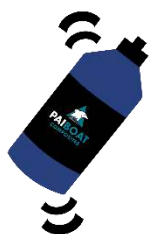
MIX BEFORE USE