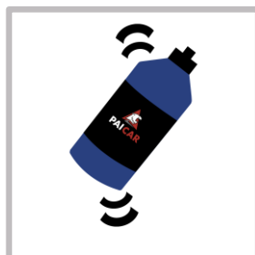
SHAKE BEFORE USE