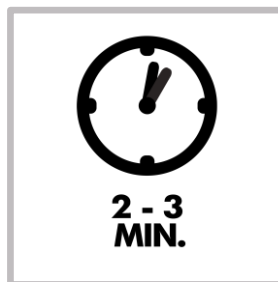
2 - 3 MIN.